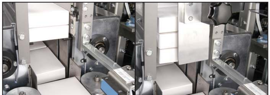
Subsequent layers are elevated in continuous sequence.