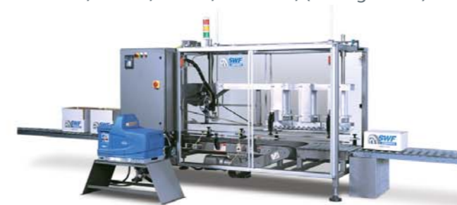
CS 440 Automatic Top Case Sealer