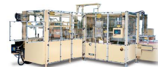
OS 500 Opener / Sealer Integrated with CL 400 Case Loader