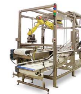
Robotic Packaging Solutions