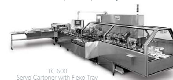
TC 600 Servo Cartoner with Flexo-Tray