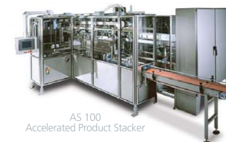
AS 100 Accelerated Product Stacker