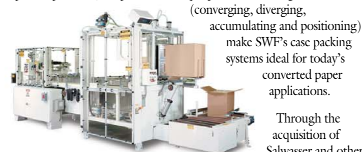
CL 405 Medium Speed Inline Case Loader

Furthermore, with operating speeds up to 30 cases per minute, SWF has delivered machine designs capable of throughput rates never achieved in the industry, including the ability to open, load and seal large paper towel cases at speeds up to 22 cases per minute. These speed capabilities, coupled with unique product handling features