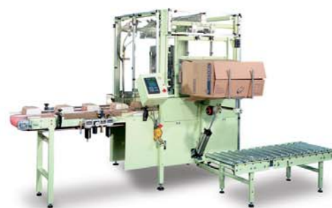
CL 100SW Compact Semi-Automatic Case Loader

We believe that the pace of change in our marketplace will continue, thus creating great challenges and opportunities. Those companies that embrace change will have the best chance to flourish as a supplier partner to leading global companies.