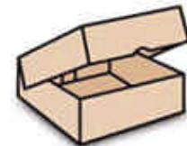
One-Piece Telescope Tray