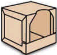
Display Bliss with Corner Posts