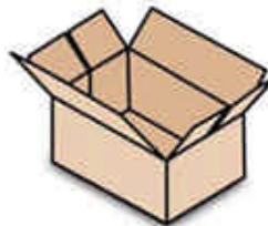
Tray with Split Minor Flaps (TSM)