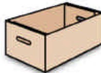
Curtain Coated Tray With Triple End