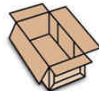
Bliss Case with Internal Flange and RSC Flaps