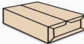
Half-Size Bliss Case With Side Flange Seal

The recent craze surrounding the Atkins, South Beach and other low-carb diets has permeated all the way down to the packaging machinery industry. As America strives for a smaller waistline, SWF Companies has witnessed an influx of activity from leading meat and poultry producers striving to keep up with shifting demands in their product mix.