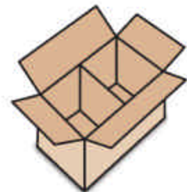
RSC Case with Internal Divider

With the necessity to address a growing demand from smaller retail outlets and/or an increased demand for higher end products, the "standard" case size is now evolving into a smaller variation approxi-