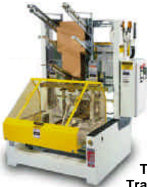
TF 400V Tray Former